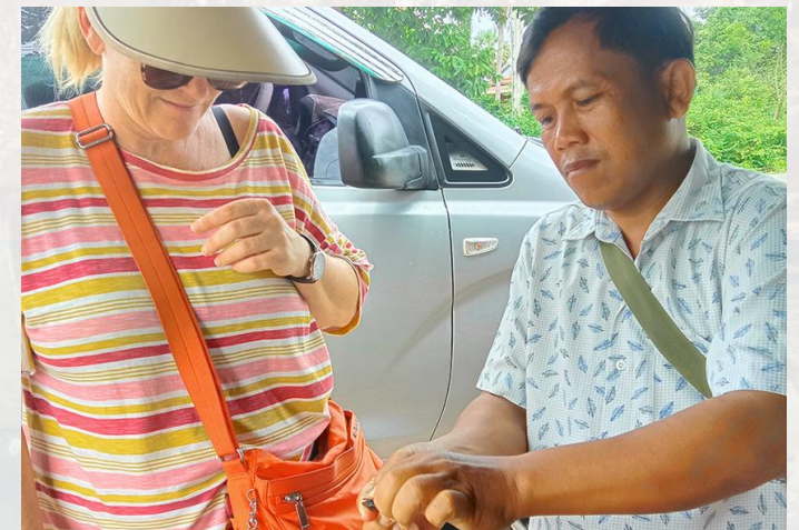
FLEXIBLE & BEYOND

Culture show, oxcart ride in rural villages