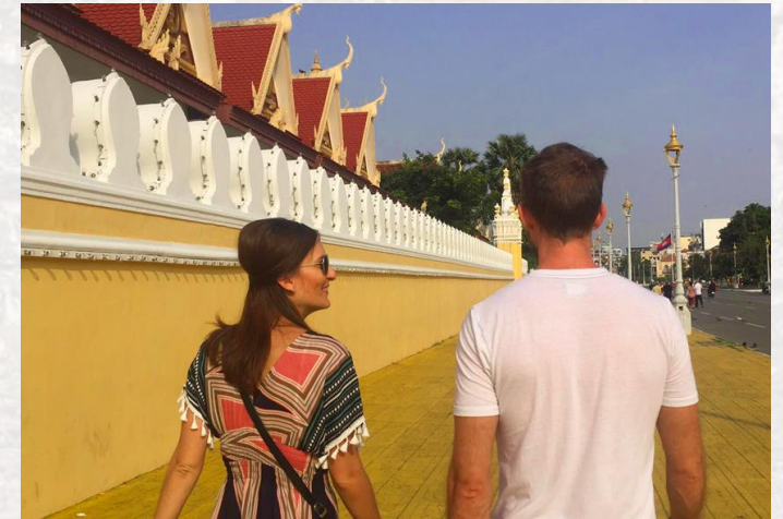
EXPERIENCED TOUR GUIDES More than 10 years experienced...