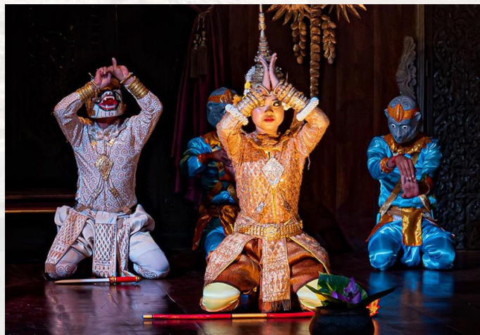
SIGHTSEEING & UNIQUE ACTIVITIES

Culture show, oxcart ride in rural villages