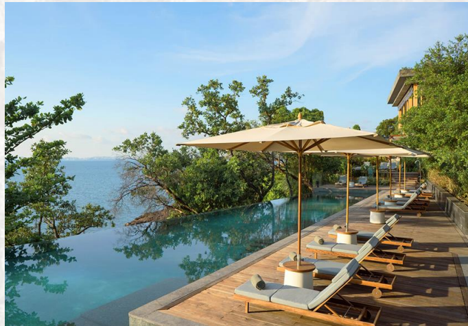
BOUTIQUE TO LUXURY RESORT From friendly 3-star to top luxury brand 5-star